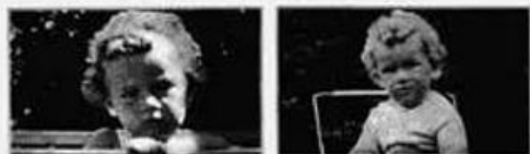
CHAS. A. LINDBERGH, JR. OF HOPEWELL, N. J.

1932 - The infant son of American aviator Charles A. Lindbergh was abducted from his home, Bruno Hauptmann being later convicted of the baby's kidnapping and murder .