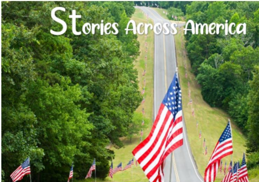
Oldest Park Ranger Turns 100