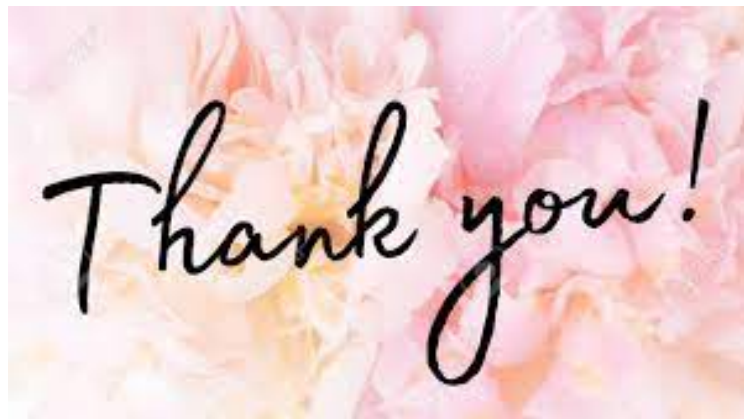
R&M Pools Patio & Garden Gifts