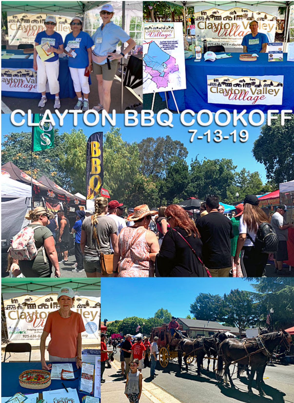
CVV at Clayton's 4th of July Parade