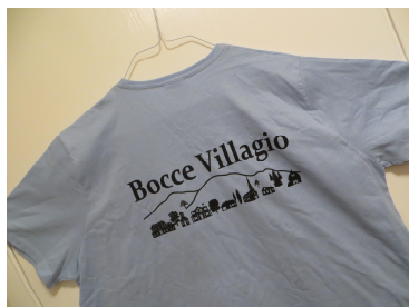
Left. The official Bocce Villagio uniform T-shirt. Some still available and soon to become a collectors' item. Contact The Villager and state desired size and color.